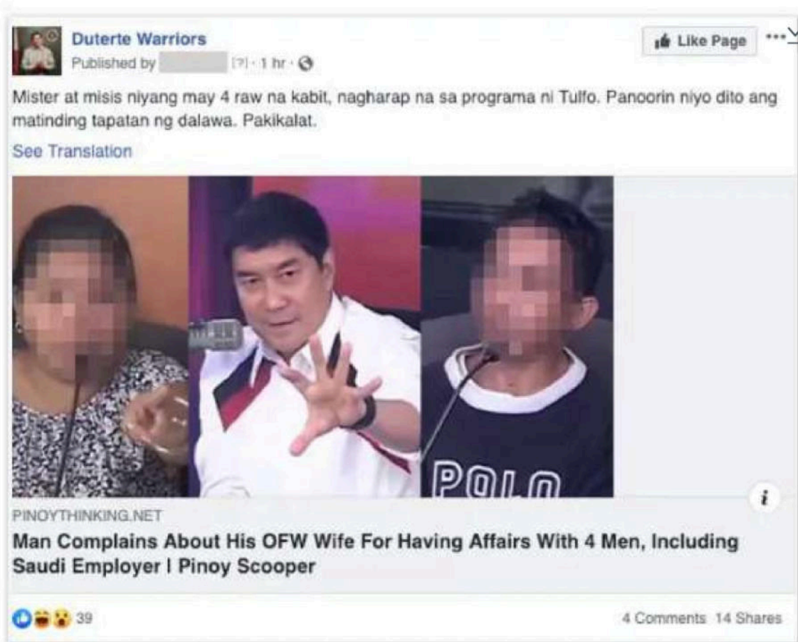
Caption: Husband and his wife that allegedly has 4 lovers, confront each other on Tulfo's program. Watch the intense confrontation of the two here. Please spread.