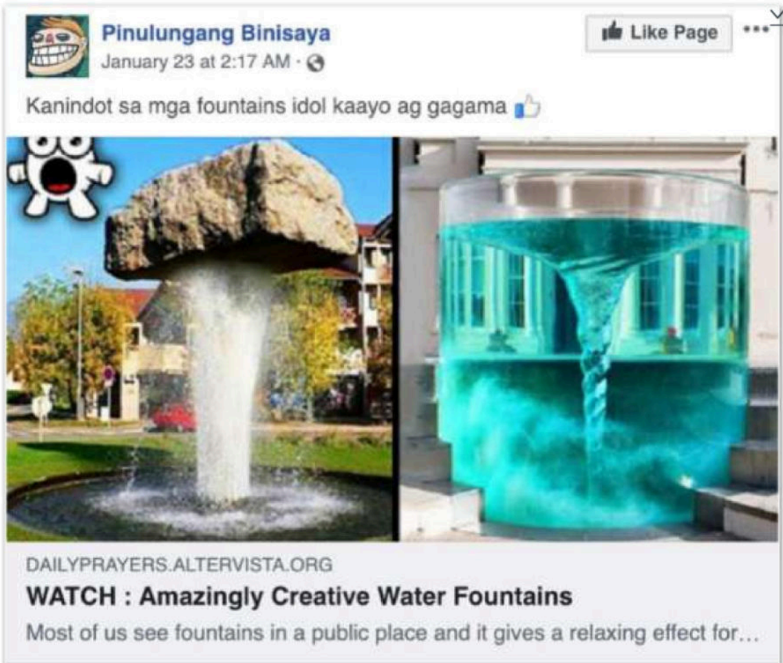
Caption: The fountains are so beautiful