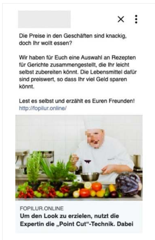
Image: An ad run by a compromised Page, targeting audiences in Germany. We blocked it before it was seen by anyone.